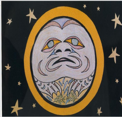
WEXES - Moon of the Frog