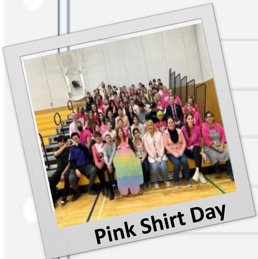
Pink Shirt Day