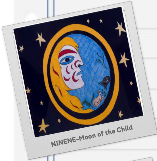
NINENE-Moon of the Child