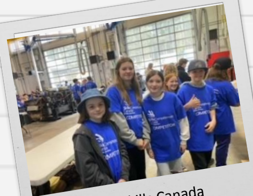
Jr. Skills Canada