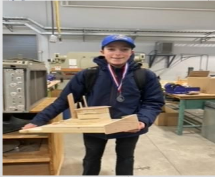
Jr. Skills Canada