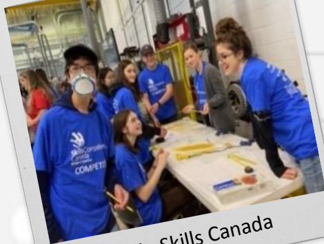
Jr. Skills Canada