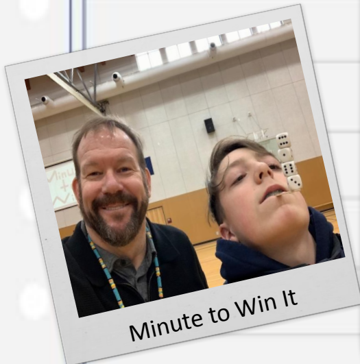
Minute to Win It