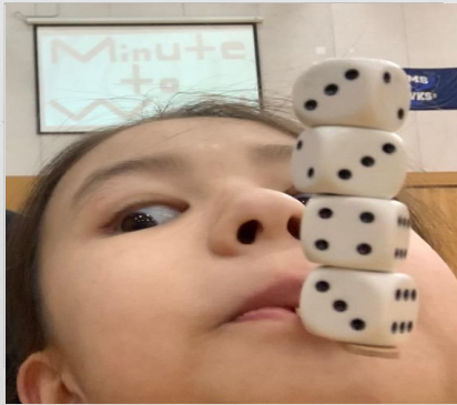
Minute to Win It