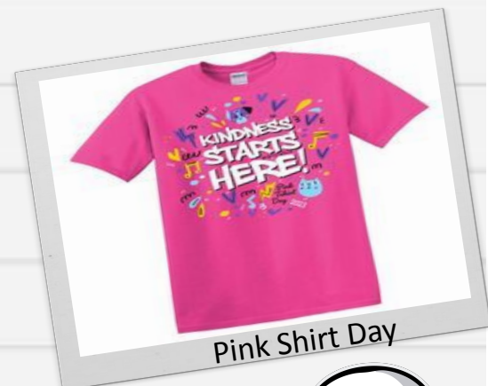
Pink Shirt Day

Feb 21-24 Interim Report Week Feb 20 - Family Day Stat Feb 22 - Pink Shirt Day Feb 28 - PAC Meeting 7:00 LC March 15 - Report Cards Home March 17 - Early Closure (1:55) -Triathlon March 20 - 31 - Spring Break